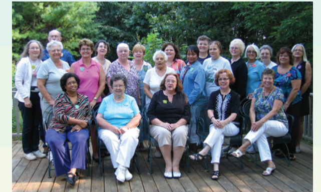
Come Quilt With Me 2010 Retreat attendees.

Learn a new and easy way to do hand appliqué for your next project. In this one hour class Pat will show you the tips and tricks to make your appliqué simple and stress free. Kit Fee $15.00 paid to Pat.